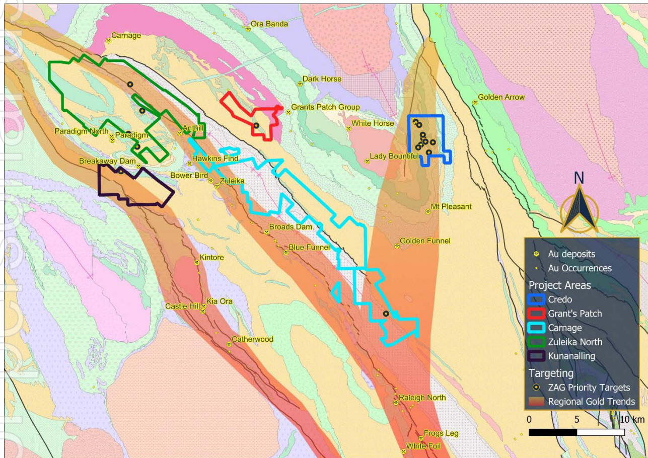
Figure 2 – Zuleika Project Areas of Interest

Grant's Patch – Characterised by surficial gold mineralisation identified through aircore drilling. Rheological complexity created by competent dolerite units within the Black Flag volcanics is considered favourable for the development of gold mineralisation.