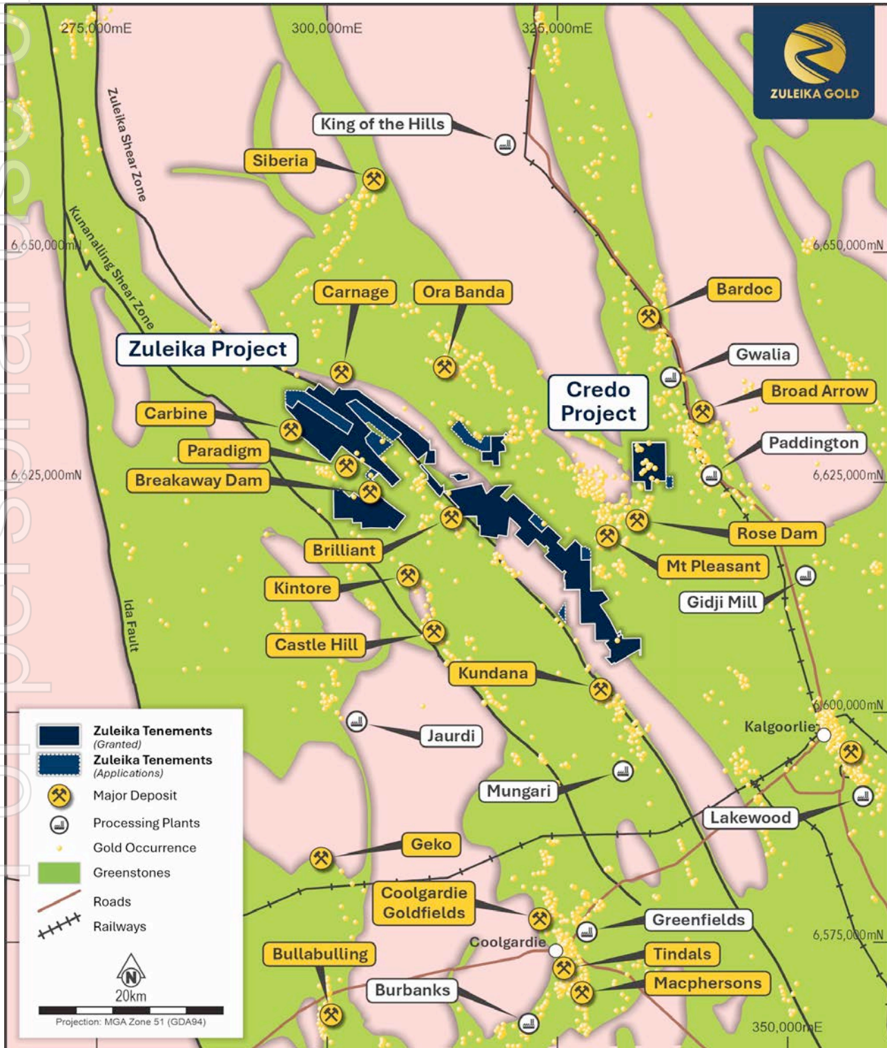
Figure 1 – Regional Location of the Zuleika and Credo Projects along Major Gold Fertile Shear Zones